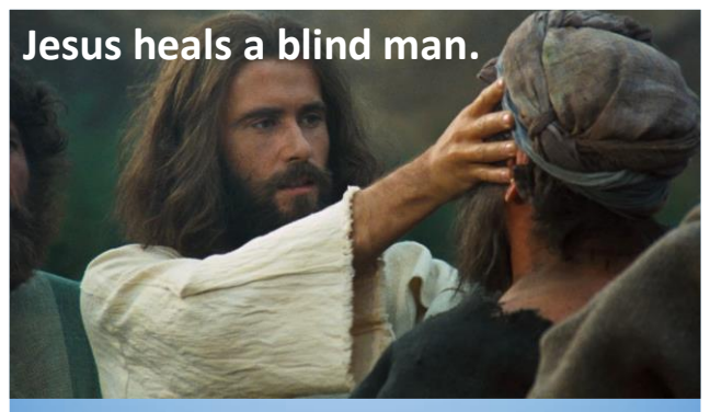
OCTOBER 27, 2024 – 23<sup>RD</sup> SUNDAY AFTER PENTECOST BAS Holy Eucharist ALL SAINTS ANGLICAN PARISH CBS

respectfully acknowledge Labrador as the homelands of the Inuit and the Innu. Let us